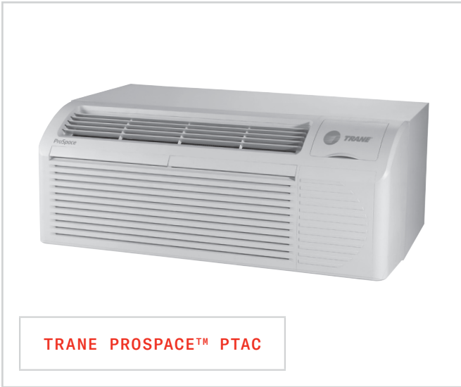
TRANE PROSPACE™ PTAC